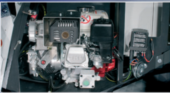
Petrol or diesel power pack as an option – power for lift also without mains.