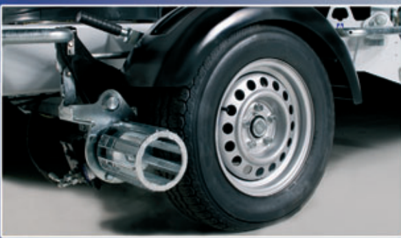
Driving system is standard – easy to move around on site.