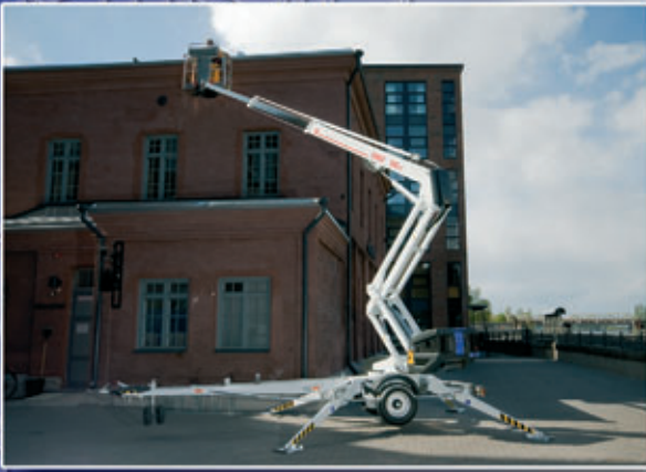
Long horizontal outreach with strong articulating boom – ensures safe access with “up and over” capability.